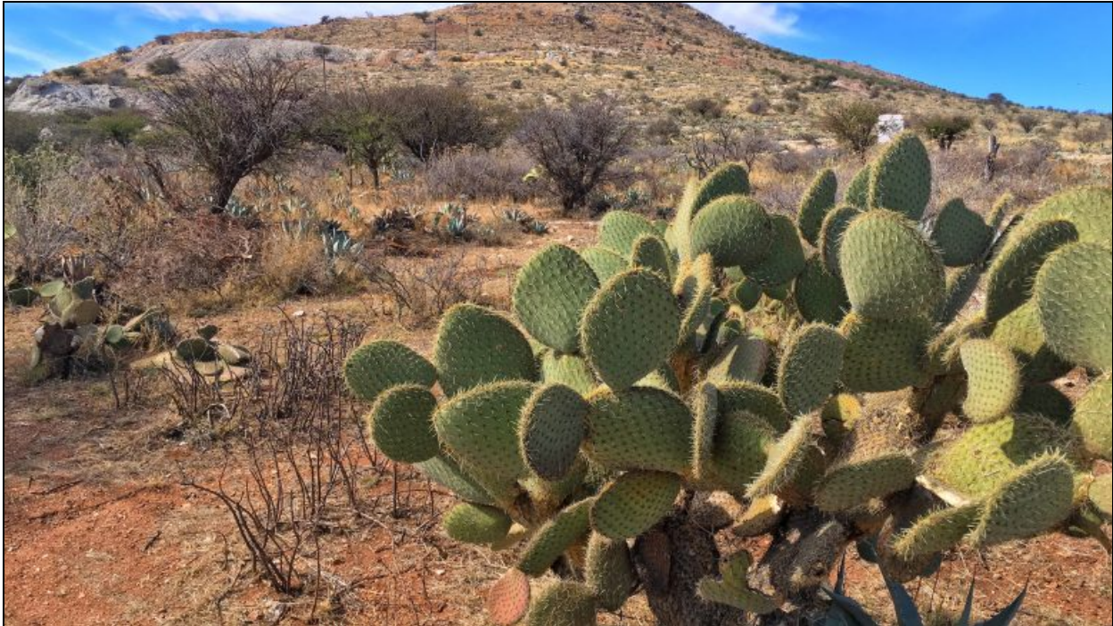
A western view of Southern Silver Exploration's polymetallic Cerro Las Minitas project in Durango state, Mexico.

POSTED BY: LESLEY STOKES FEBRUARY 3, 2017