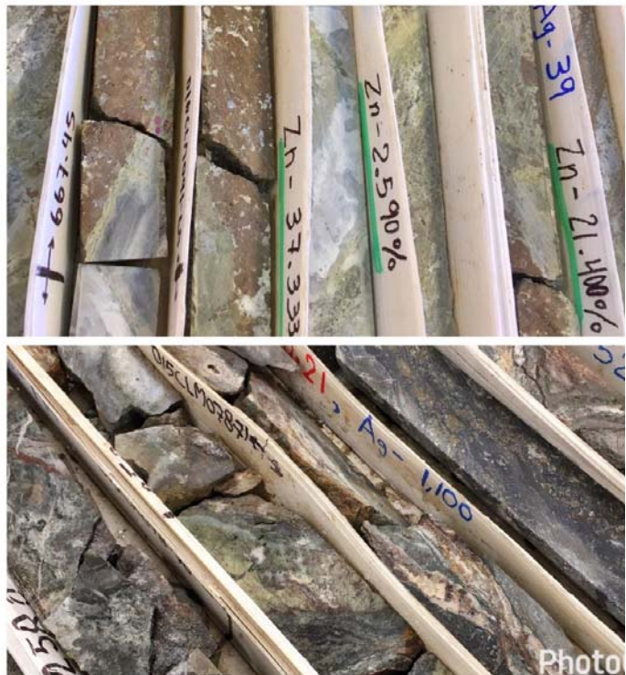
Top: High-grade zinc drill core from Southern Silver Exploration's shallowly dipping Blind Shoulder zone, a skarn target at roughly 600 metres depth. Bottom: High-grade silver drill core from the steeply-dipping Blind skarn deposit.